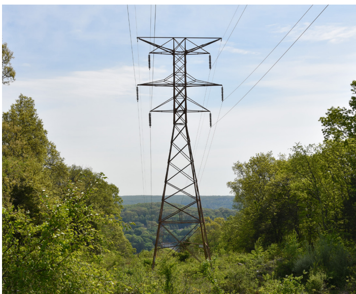
Typical existing lattice steel structure in Derby

Completion/In-Service Date: 3rd Quarter 2025